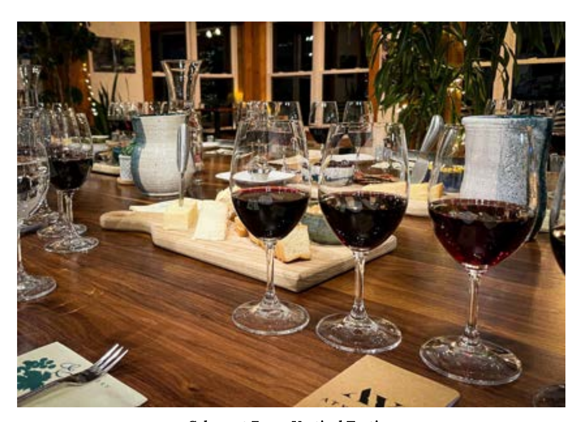
Cabernet Franc Vertical Tasting Saturday, April 27 6:30-8:30 p.m.

In this special tasting, you'll receive exclusive library samples of our 2017, 2019, and