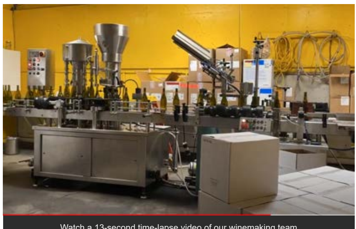
Watch a 13-second time-lapse video of our winemaking team bottling the Chardonnay Reserve.

The clogged filters and the low-fill bottles are only two of the many problems that can occur throughout the day. The corker and the labeling line each present their own issues. This is why a winemaker may groan when it comes to bottling days! They present numerous challenges but the results are always worth it.